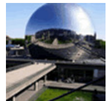
6th Congress Venue Cité des sciences et de l'industrie, Paris

Through these discussions, the Congress hopes to shape a balanced approach to the rights of IP holders and the needs of governments and consumers; and the costs of enforcement to governments and right holders alike.